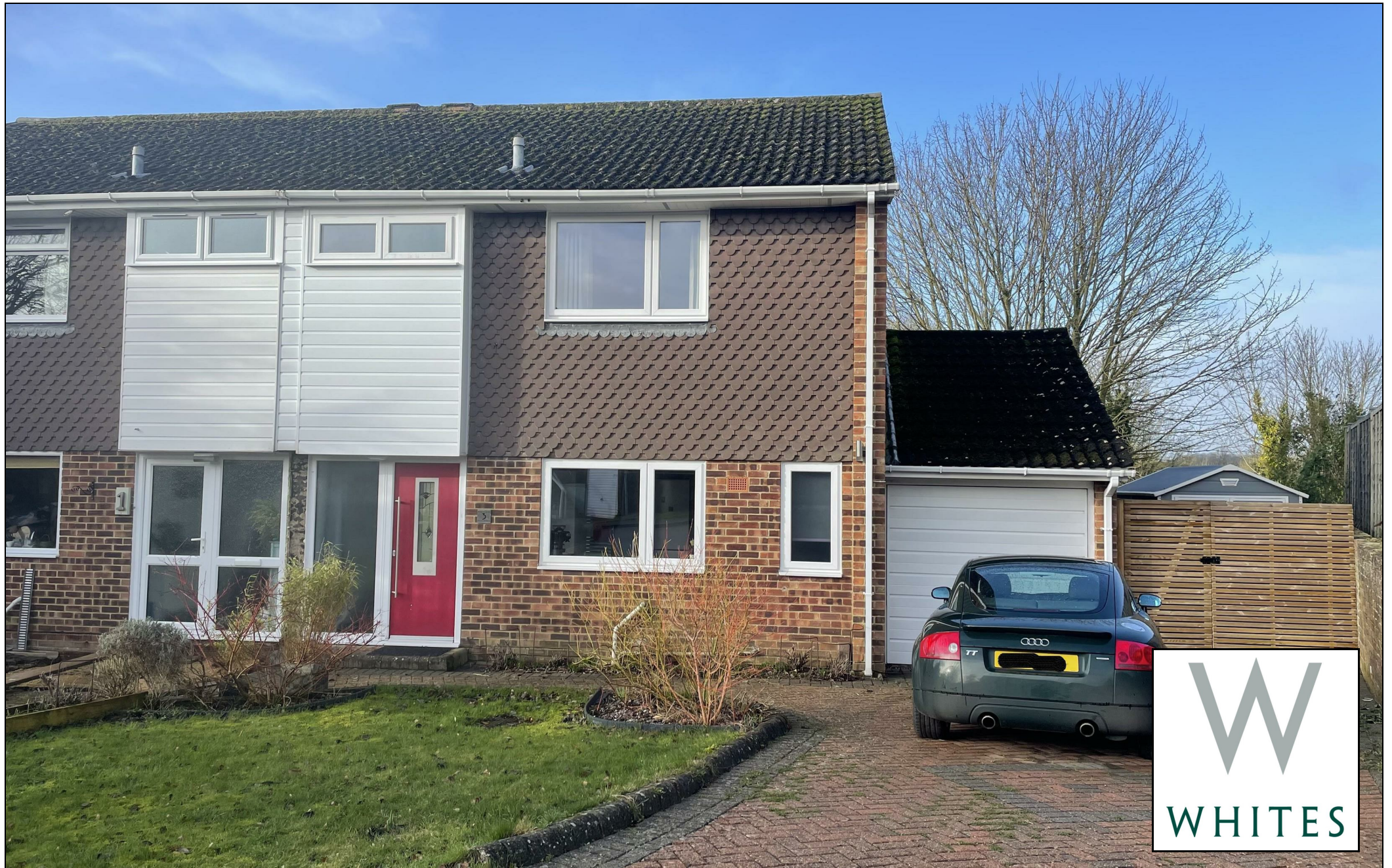
3 The Limes, Porton, Salisbury, Wiltshire, SP4 0LT